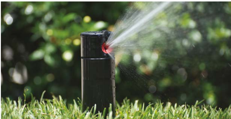
PGP Red Standard Nozzle

PGP-ADJ-07 = 4" pop-up, adjustable arc, and #7 red nozzle